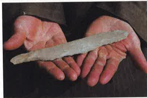
ARTIFACTS recovered from Heit el-Ghurab include items such as bread molds (top) and flint knives (bottom). They are helping archaeologists piece together how the pyramid builders lived.