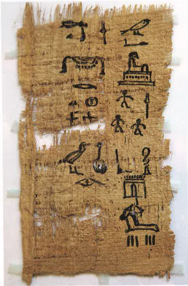
AT THE SITE of Wadi el-Jarf on the Red Sea, archaeologists have found remnants of the oldest known harbor (left). Artifacts include such fragile remains as the fragment of inscribed papyrus above.

such as the pyramids are often considered general indicators of a society's wealth. Indeed, for decades many Egyptologists have thought that the pharaohs stopped building gigantic monuments to themselves because the nation had grown poorer.